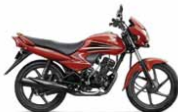
DREAM YUGA Honda Motorcycle and Scooter India Private Limited