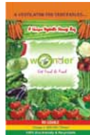
WONDER FRESH Colour Xpress Pvt Ltd