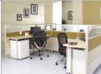
WISH Godrej Interio (Division of Godrej and Boyce Mfg Co. Ltd)