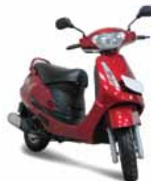
DURO DZ Mahindra Two Wheelers Ltd