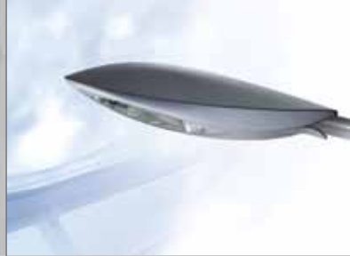
VOLA STREETLIGHT Wipro Limited