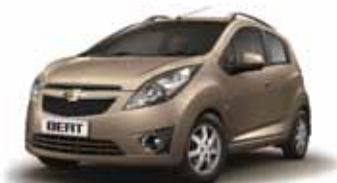
CHEVROLET BEAT General Motors India