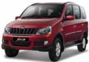
XYLO Mahindra & Mahindra Limited