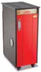
WHISPER SUPREME Milcent Appliance Pvt Ltd