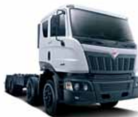
31T HCV (MN31) Mahindra Navistar Automotives Ltd