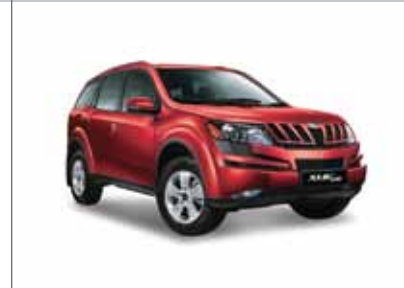
XUV500 Mahindra & Mahindra Limited