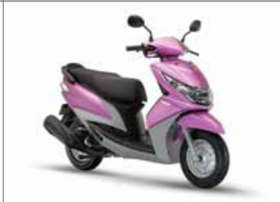
YAMAHA RAY India Yamaha Motor Pvt Ltd

IMark symbolizes product excellence in form, function, quality, safety, sustainability and innovation and communicates that the product is usable, durable, aesthetically appealing & socially responsible. IMark is a trustworthy indicator of excellence. The symbol can be used in a wide range of ways, such as advertisements, catalogues, product packaging, and other promotional mediums.