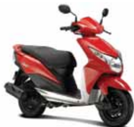
DIO Honda Motorcycle and Scooter India Private Limited