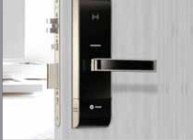
TRANE ELECTRONIC MORTISE LOCK Ingersoll-Rand International India Ltd