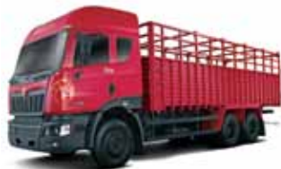
25T HCV (MN25) Mahindra Navistar Automotives Ltd