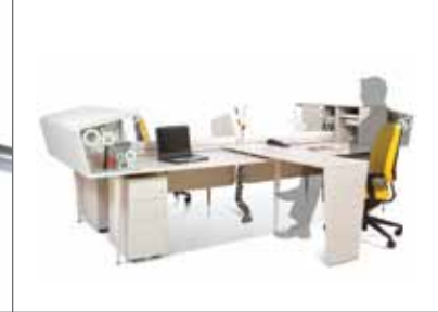
VURV Godrej Interio (Division of Godrej and Boyce Mfg Co.)