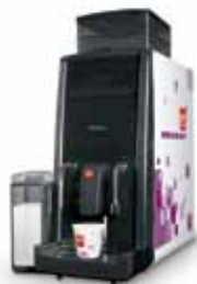
CELESTA Amalgamated Bean Coffee Trading Co. Limited