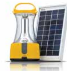
D.VA SOLAR LANTERN Larsen & Toubro Limited